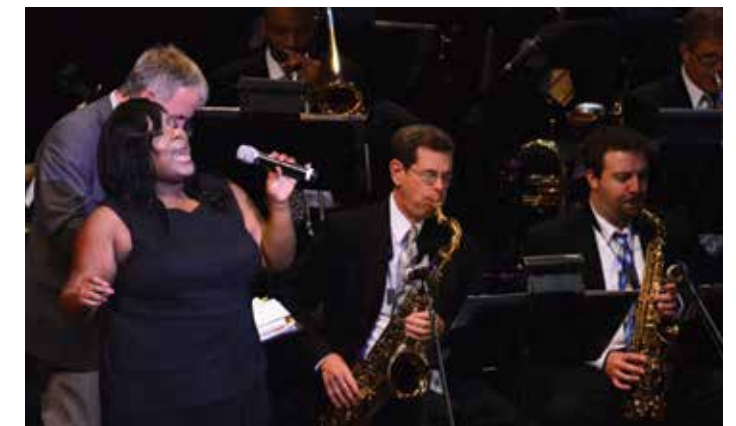
Drummond performed with the Cleveland Jazz Orchestra in King Concert Hall.

* Aired Jan. 9, 2015; viewable at www.pbs.org/wnet/gperf/american-voices-reenee-fleming-full-episode/3739/