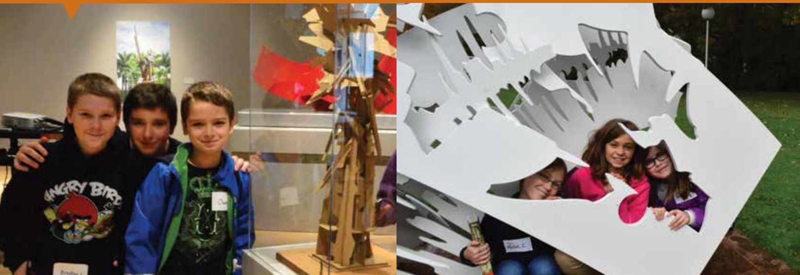
Area school children enjoy field trips at the Cathy and Jesse Marion Art Gallery, left, and the new, 16-ton outdoor sculpture, "Progression," installed last fall in front of Fenton Hall.