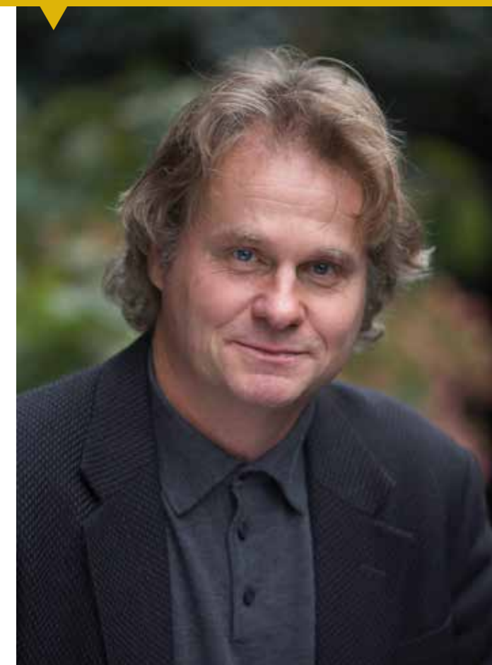
Dr. Wade Davis will speak April 12 in King Concert Hall.

A rare opportunity awaits Fredonia with the arrival of Dr. Wade Davis — described as “a rare combination of scientist, scholar, poet and passionate defender of all of life's diversity” — who will deliver the keynote address of the 2015–16 Convocation series, “Rediscovering the Diversity of the Human Spirit.”