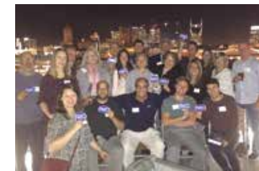
Alumni gathering in Nashville, Tenn.