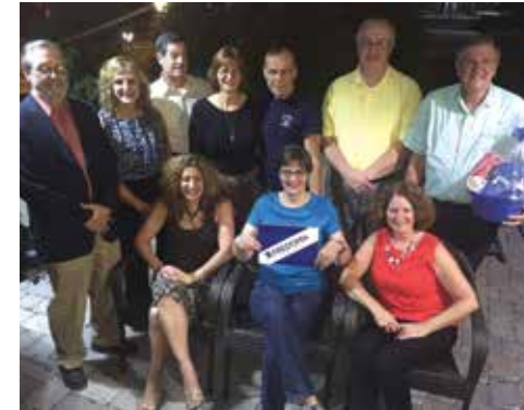
Alumni gathering in Syracuse, N.Y.