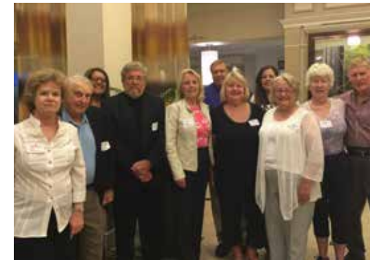
Alumni gathering in Elmira, N.Y.