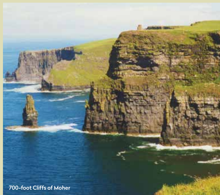
700-foot Cliffs of Moher