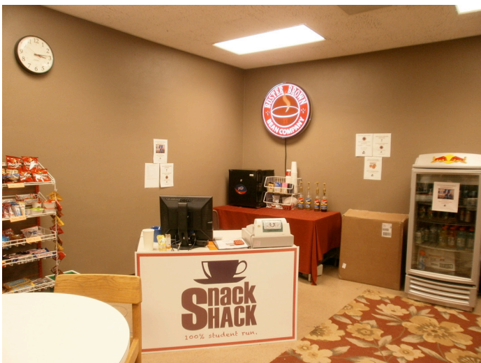
The Snack Shack on the third floor of Thompson Hall is a fund-raising segment of Business Club