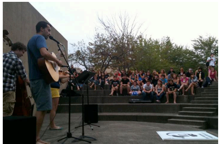
Students gather to hear performances at an Open Mic Night