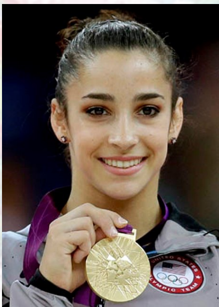
Aly Raisman, Gold Medalist

Jewish women have been in sports since the early 1900s. As of recently, the most famous Jewish athlete has to be Aly Raisman. Apart of the United States gymnastics team that has been nicknamed the "Fierce Five," she won 2 gold medals at the London Olympics and 2 world championships in 2011 and 2015. To win her gold medal for her individual floor routine, she put her gymnastics to the tune of "Hava Nagila," also becoming the first American woman to win gold in a floor routine. After performing her routine she also paid tribute to the Israeli athletes that were killed in 1972 even after the International Olympic Committee refused to honor them on the 40th anniversary of the event. She is coached by a former Israeli team coach and has received many awards from Jewish organizations for her athletic