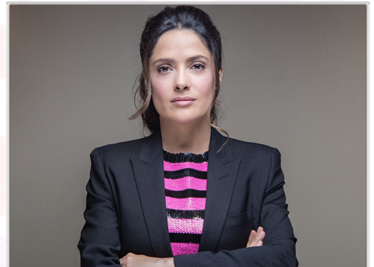
Actress Selma Hayek

Salma is very passionate about this work, and treats it as a part of her identity an individual in the public eye. She has spoken to the effect that this problem of domestic violence can be stopped, but only through activism, and advocacy. It is an issue that invokes silence among victims, and takes on different shapes in various international cultures. Mrs. Hayek also notes that men specifically need to support this cause. Selma Hayek's activism is powerful and a model of how those with public acclaim should make use of their fame.