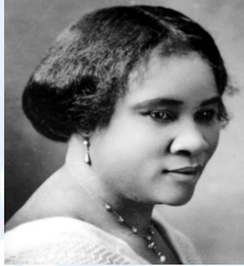
Madam C.J. Walker