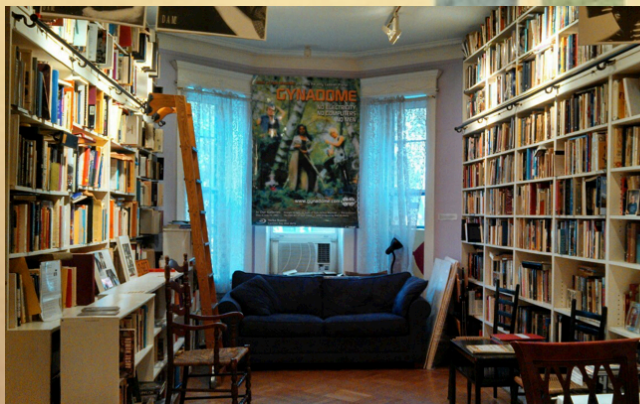
Interior of the Lesbian Herstory Archives

In 1979, following the Stonewall riots in 1969, gay liberation activists from the City University of New York formed the GAU, or Gay Academic Union. The GAU promoted education about gay issues and representation of gay students, teachers, and workers. About a year later some women in the GAU formed a separate space